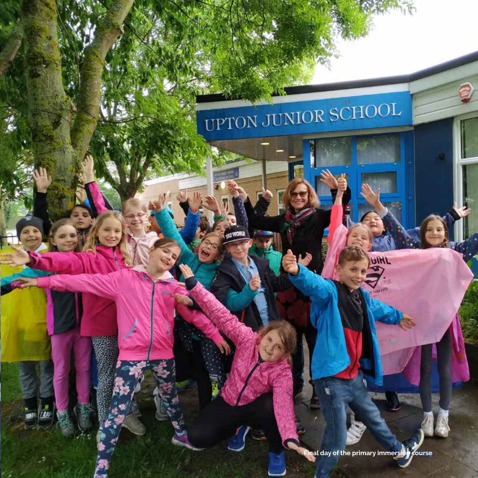
Final day of the primary immersion course