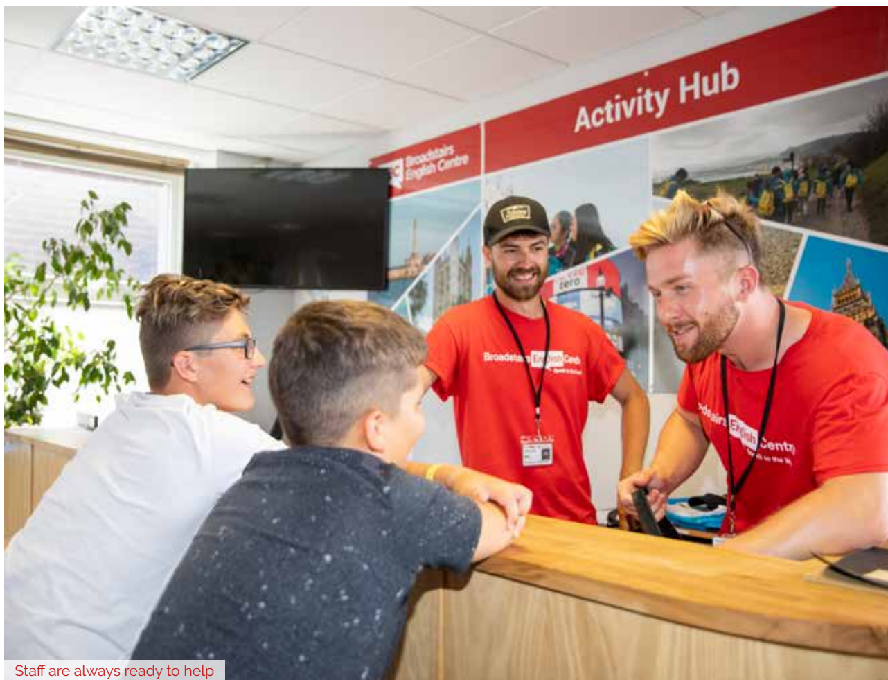
Staff are always ready to help

“In the 20 years I've been bringing groups to the UK, I have never felt so spoilt as a group leader.”