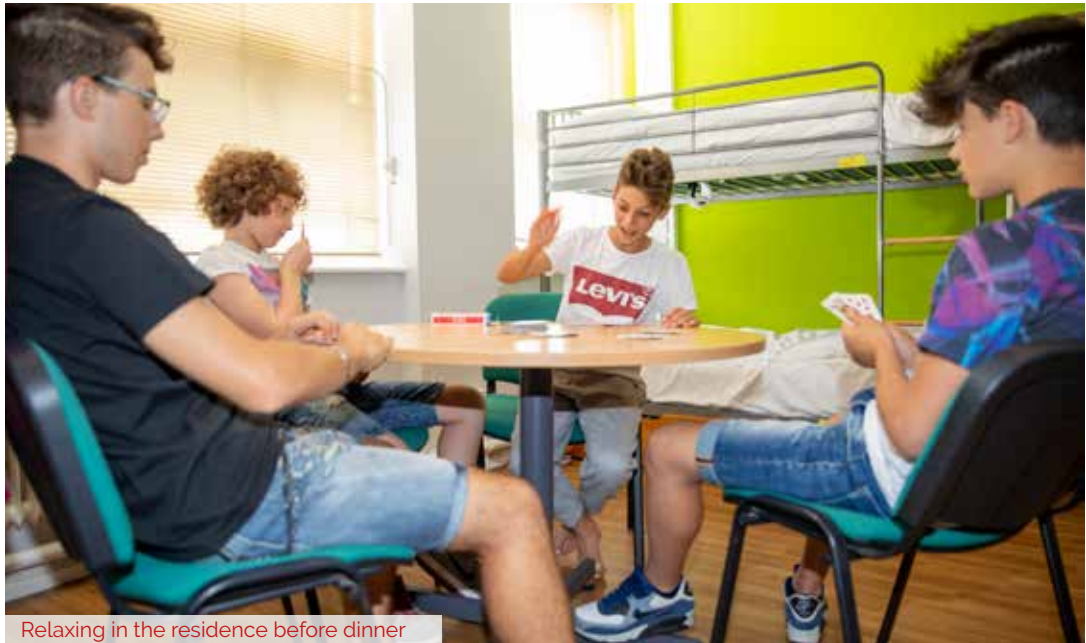
Relaxing in the residence before dinner