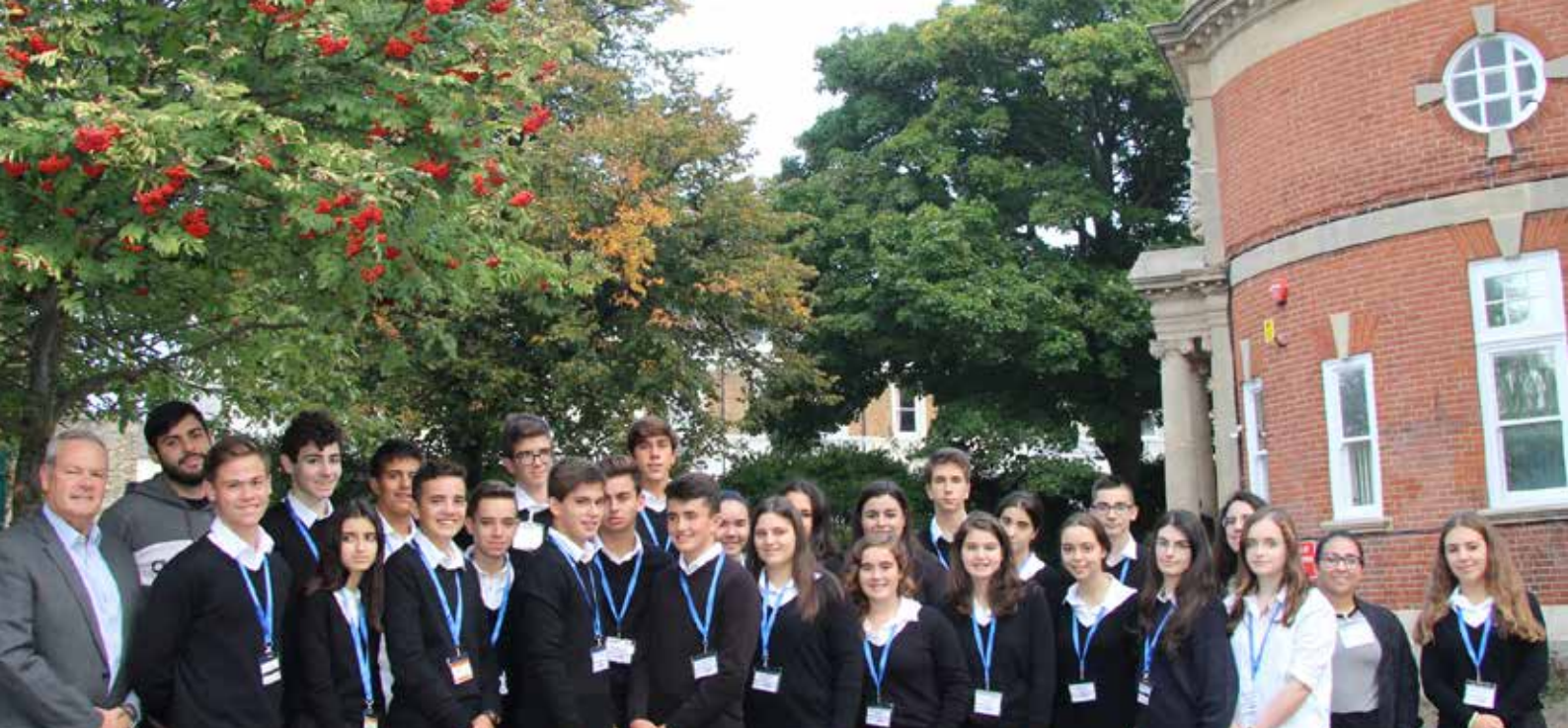
Final day of the secondary immersion course at Chatham and Clarendon Grammar School