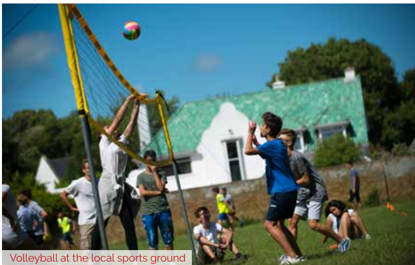
Volleyball at the local sports ground